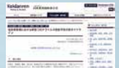
As of Dec. 1, 2020

Awareness of antibacterial and sterilization at manufacturing and production sites is increasing, and the guideline for disinfection of tools is described in the "Guidelines for Preventing New Coronavirus Infection at Manufacturing Plants" issued by the Keidanren (Japan Business Federation).