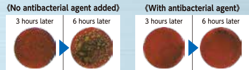
*Antibacterial test with Staphylococcus aureus

The added antibacterial agent has excellent heat resistance, water resistance, and weather resistance, and maintains the antibacterial effect for a long period of time.