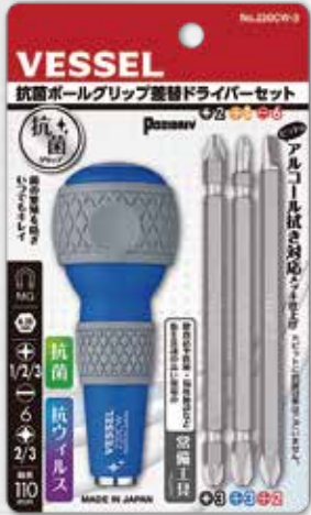
Antibacterial Ball-Grip Interchangeable Driver Set (No.220CW-3)

Meet the needs for antibacterial and antiviral tools