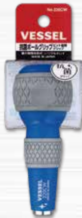
Antibacterial Ball-Grip Handle (No.220CW)

The bit is compatible with alcohol wiping. *The bit has no antibacterial effect.