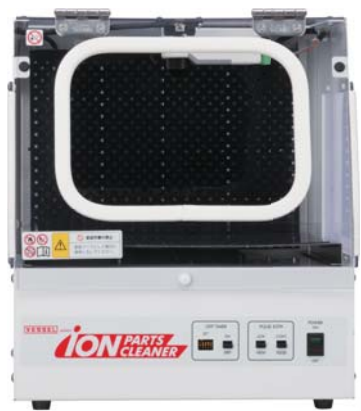
No. IPC-A4 Ion Parts Cleaner

Static electricity elimination and dust removal in a hood. Dust adhered by static electricity is neutralized in the ionized hood and then removed by powerful automatic air blow.