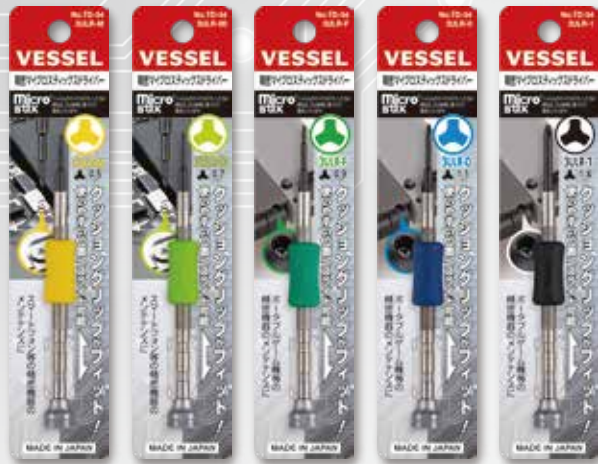
TD-54 3ULR-M TD-54 3ULR-00 TD-54 3ULR-F TD-54 3ULR-0 TD-54 3ULR-1