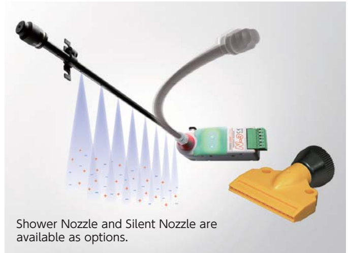
Shower Nozzle and Silent Nozzle are available as options.

Interchangeable nozzles for various applications (option)